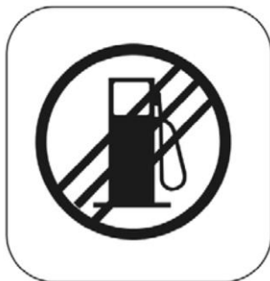
End of Refuelling Zone