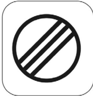
End of Control